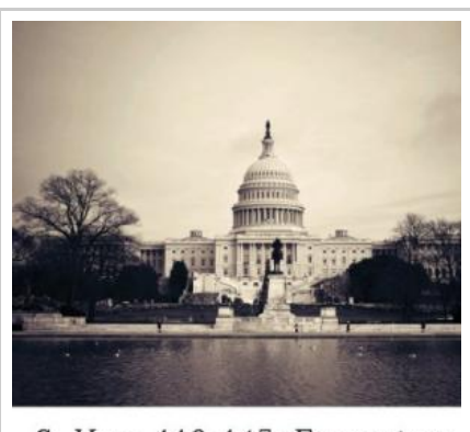
S. Hrg. 112–145: Emerging Threats to Rail Security